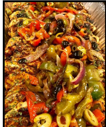
Italian Style Chicken & Peppers