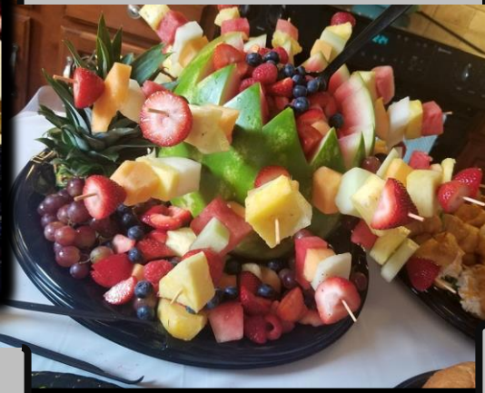
Watermelon Display (SEASONAL ONLY)