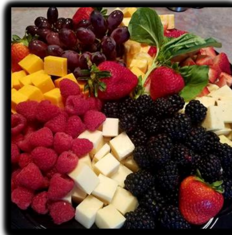
Fruit & Berry Display

(Individual Canned Soda or Bottled Water)