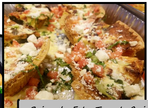
Spinach, Feta, Tomato Quiche

Call 412-867-9196 waterfallcatering@verizon.net www.thewaterfallcafe.com